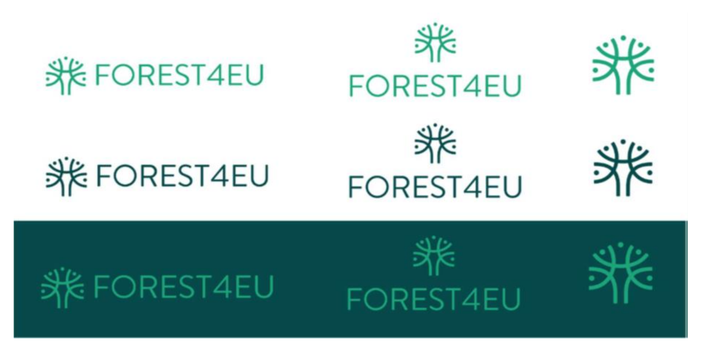
Figure 2. Color codes and fonts